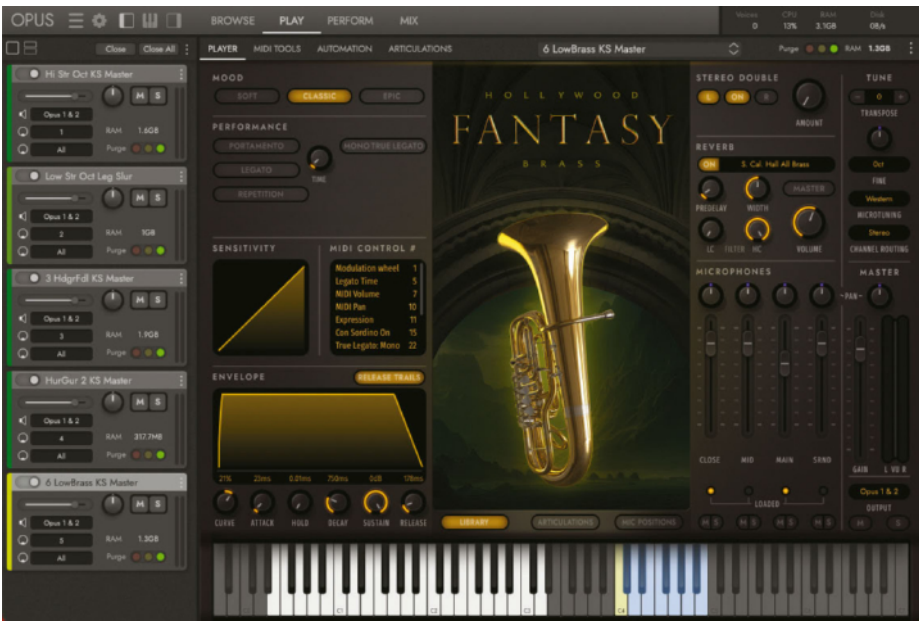
Hollywood Fantasy Brass supplying low-end brass with aplomb!

the violin. On a similar tack, EastWest also provide six celli and four basses, in octaves, mirroring the top end of the string section.