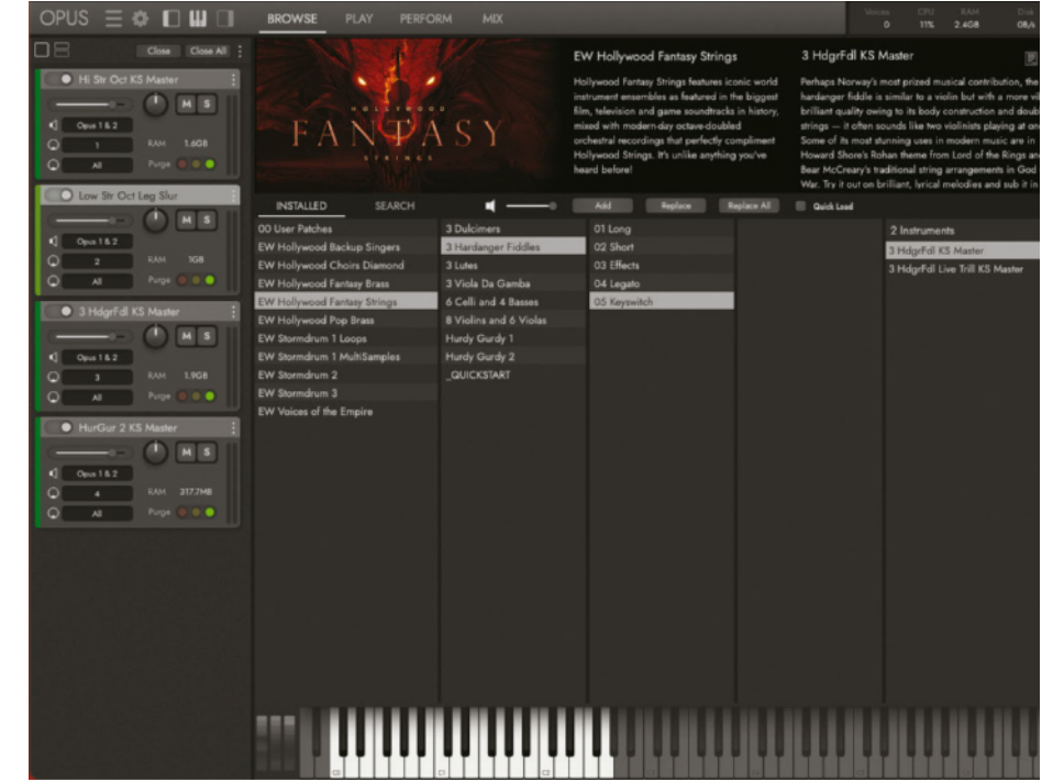
Through the new Opus interface, accessing and adding patches is a blissfully simple process

with a relative brightness and capacity to cut through a mix, just when you need it.